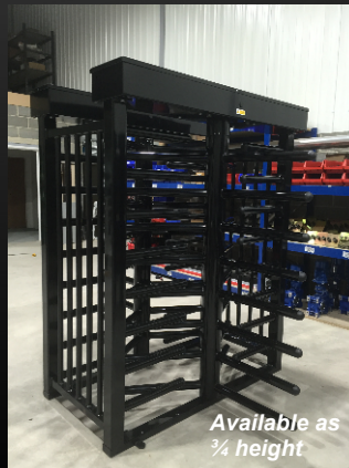
Available as ¾ height