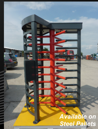
Available on Steel Pallets